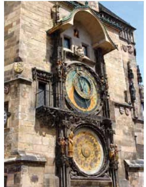
Astronomical Clock Prague, Czech Republic