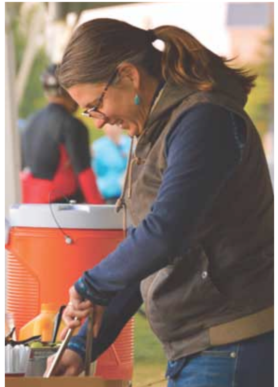
2016 HeART of Idaho Century Ride volunteer servicing breakfast at Snake River Landing.