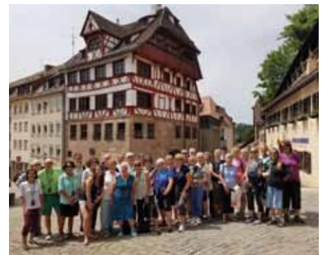
Art History Tour Group outside Dürer's house.

Special thanks to tour guide Conny Cossa for his many hours of thoughtful preparation and wealth of expertise that enabled the group to bypass long lines and utilize the most out of each and every day