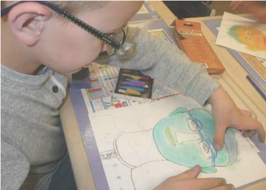
ARTworks classroom visit.

The Art Museum of Eastern Idaho dedicates memorial, legacy and honoraria contributions to the acquisition of permanent art collection pieces as designated by the donor. If the donor expresses a different expectation, that wish is honored.