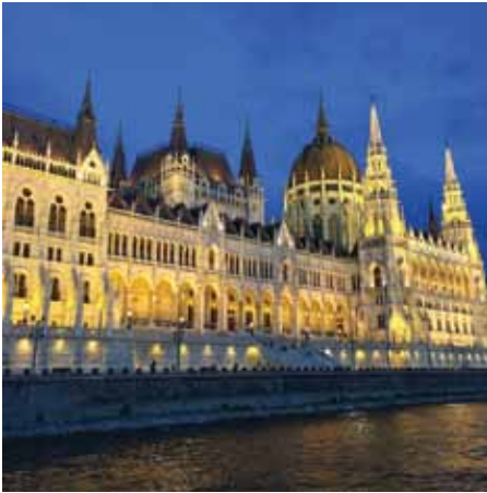
Hungarian Parliament Building Budapest, Hungary