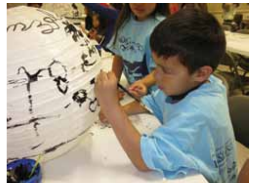
Young at Art Family Day, April