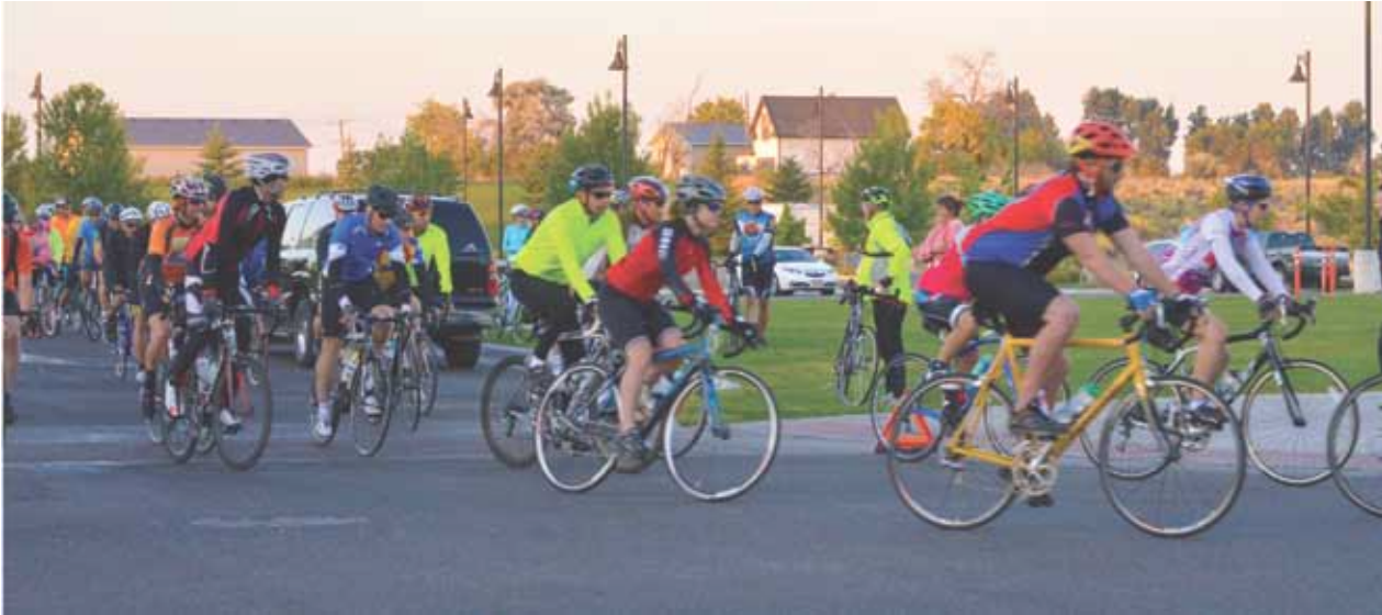
Starting line of the 2016 HeART of Idaho Century Ride.