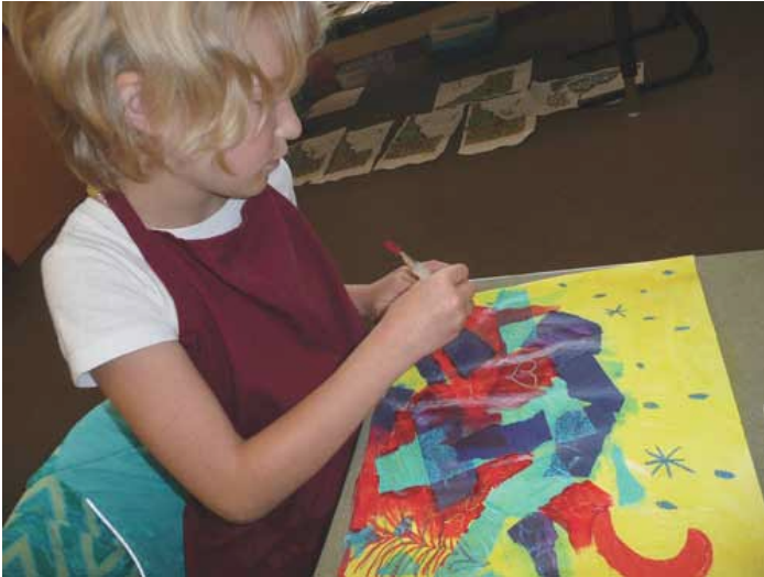
Outreach at Discovery Elementary School in Ammon, Idaho