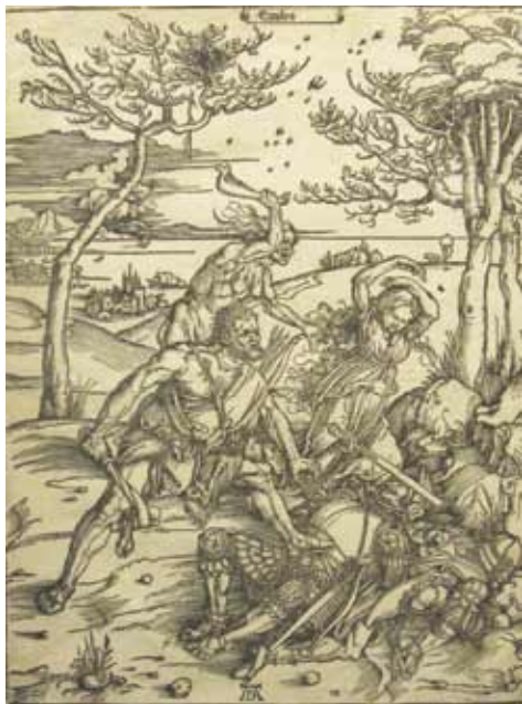
Hercules Conquering the Malionide Twins by Albrecht Dürer